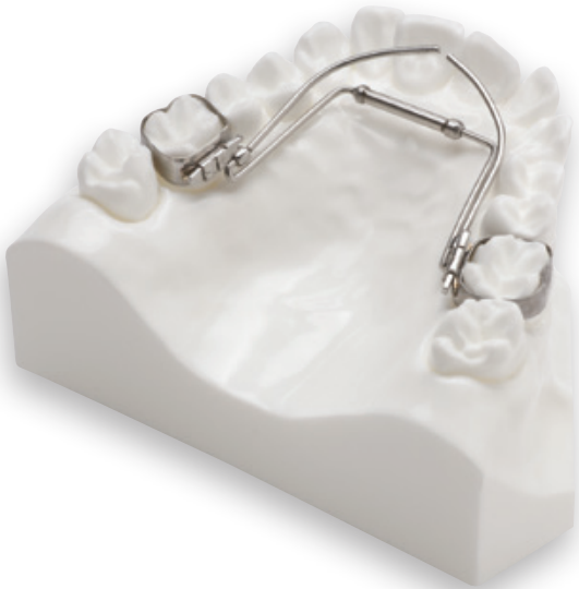
Transverse Arch Developer