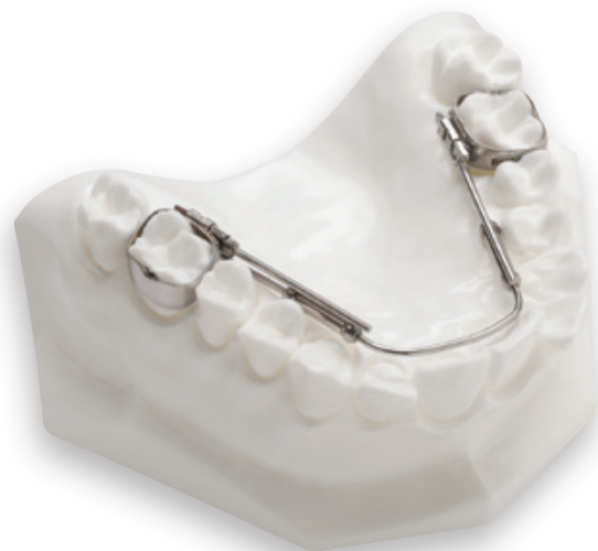
Sagittal Arch Developer